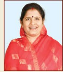
Smt. Pravati Parida Hon'ble Deputy Chief Minister of Odisha