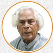
Shri Sudarshan Sahoo Padma Vibhushan, Eminent Sculpture Artist