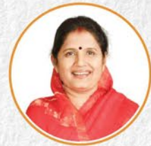
Smt. Pravati Parida Hon'ble Deputy Chief Minister, Odisha and Minister of Women & Child Development, Mission Shakti and Tourism